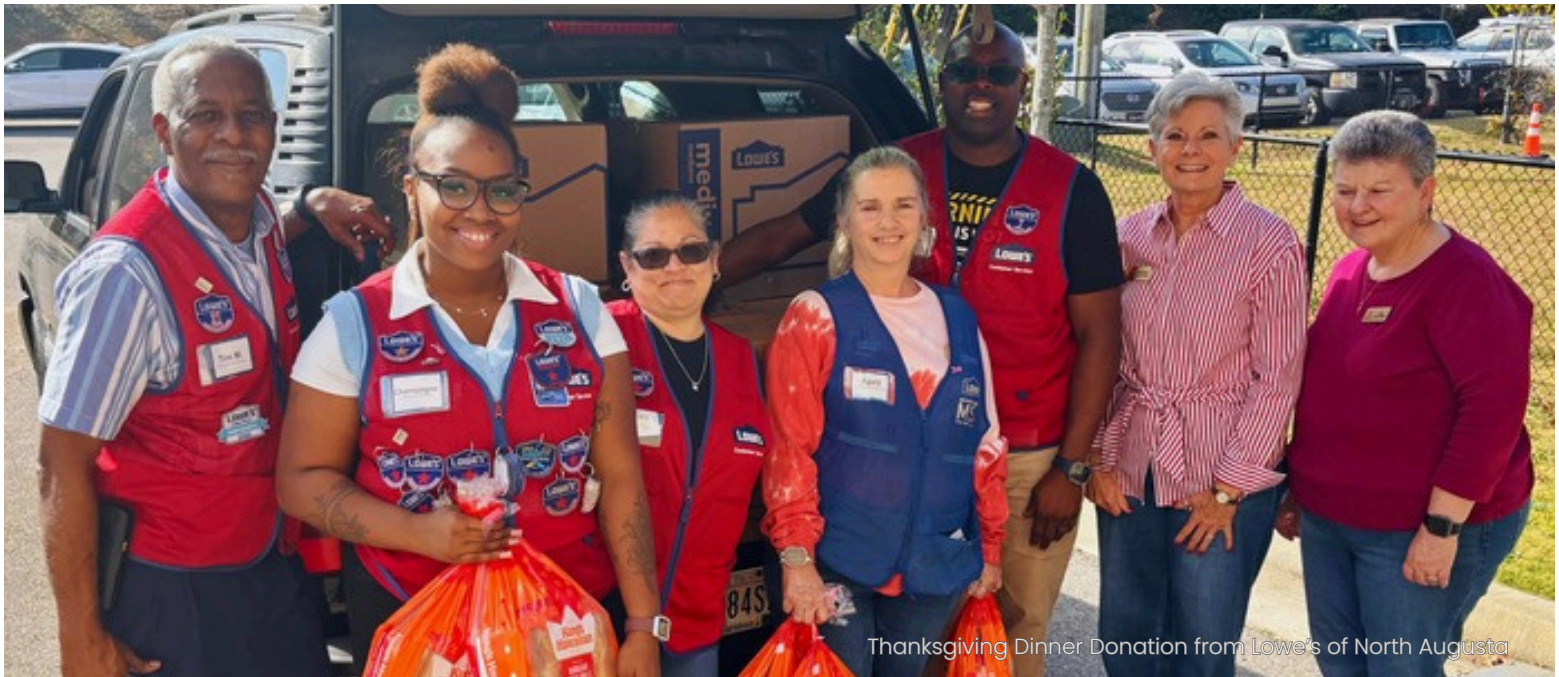
Thanksgiving Dinner Donation from Lowe's of North Augusta