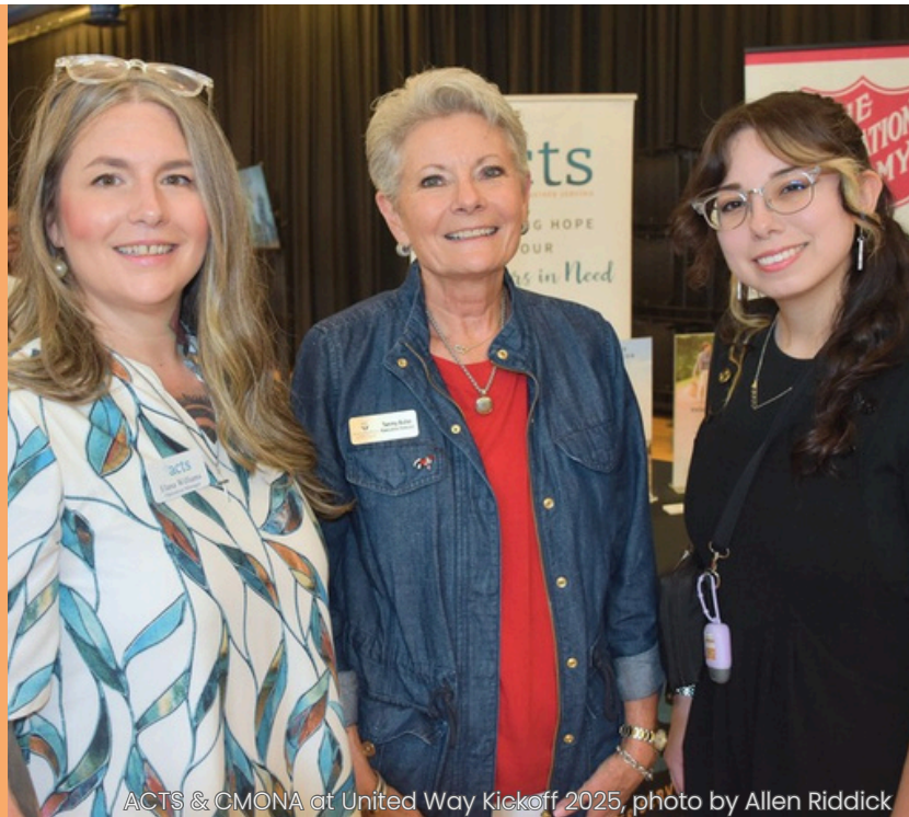
ACTS & CMONA at United Way Kickoff 2025

Community Partners support CMONA through grants, services, monetary support, or other contributions – like food drives, volunteer sessions, and events.