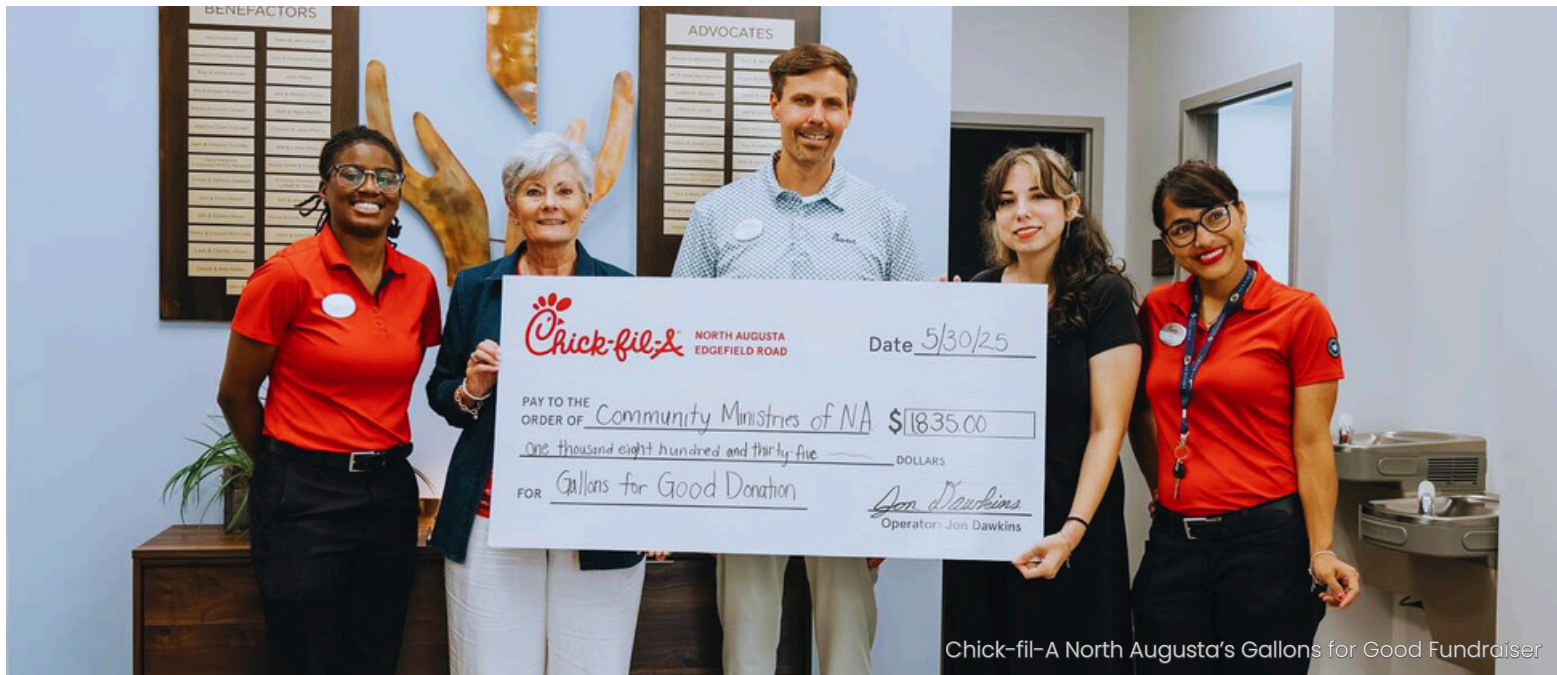
Chick-fil-A North Augusta's Gallons for Good Fundraiser